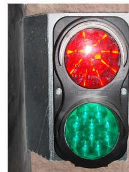
Outside Assembly with Optional AP3921 Bracket