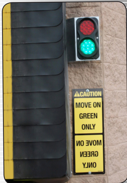
Outside Light Assembly