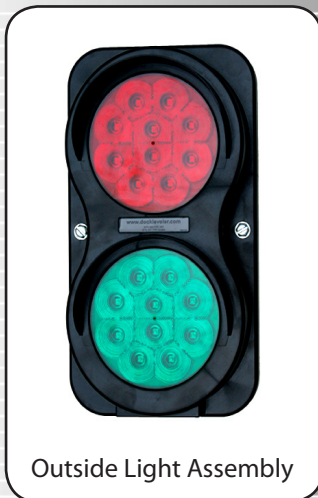
Outside Light Assembly

The APS&GO is an important communication tool for dock workers and truck drivers. It reduces the potential for serious accidents from truck drivers pulling away before loading/unloading is finished.