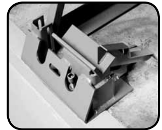
Front SafeTFrame™ Pedestal